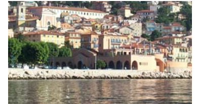
Land Based IT Services