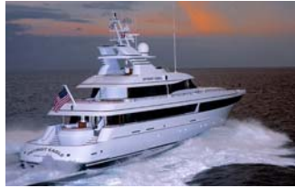
Yacht Based IT Services